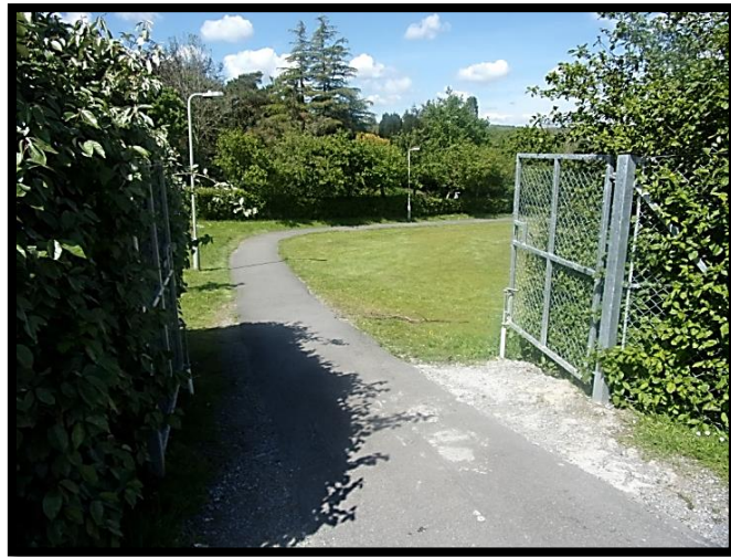
I will walk down the path, past the field.