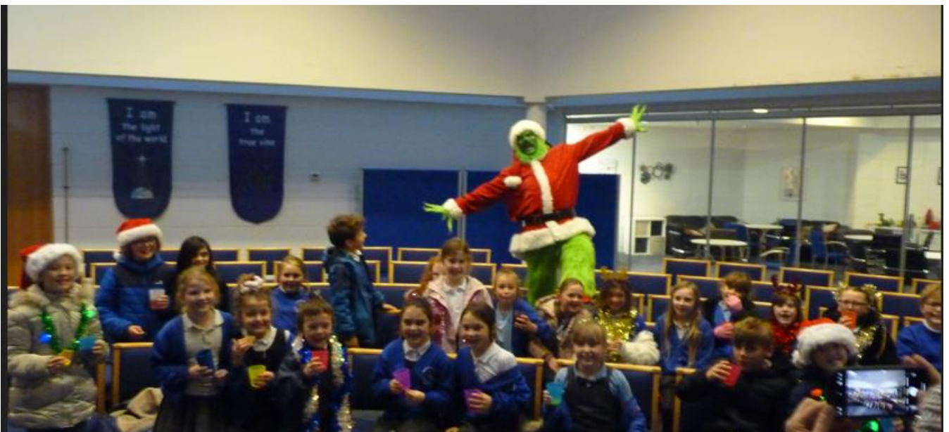
Our choir, sharing complete joy and excitement on meeting 'The Grinch!'. Buckfastleigh Christmas Fayre 2024.